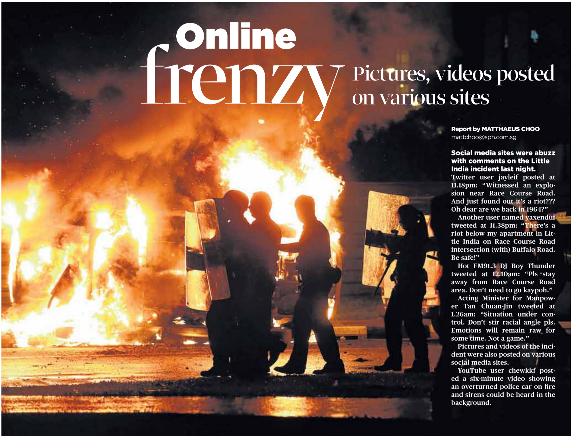
ON THE GROUND: Riot police forming up at the scene of a burning police car on Hampshire Road in Little India yesterday.

YouTube user chewkkf posted a six-minute video showing an overturned police car on fire and sirens could be heard in the background.