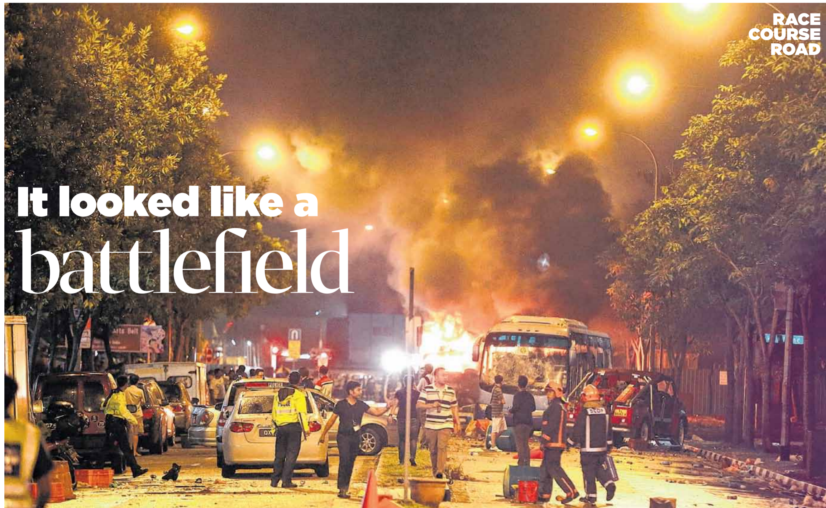
RACE COURSE ROAD